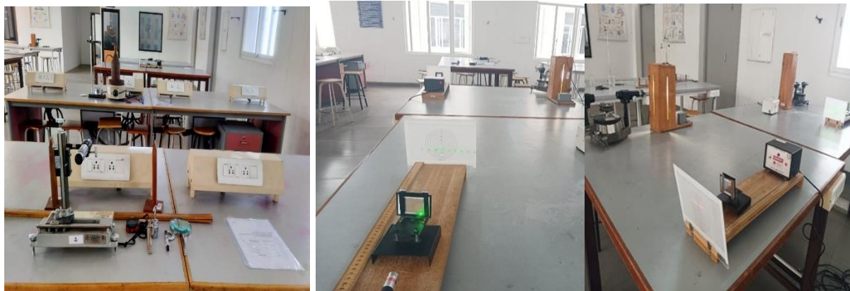
Fig. Physics Laboratory