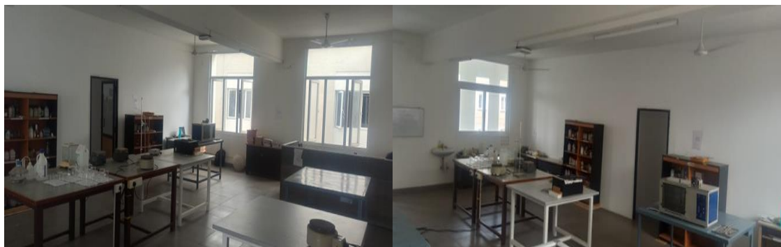
Fig. Advanced Materials Science Laboratory