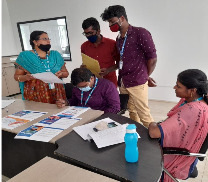
Information sharing with students and Faculties